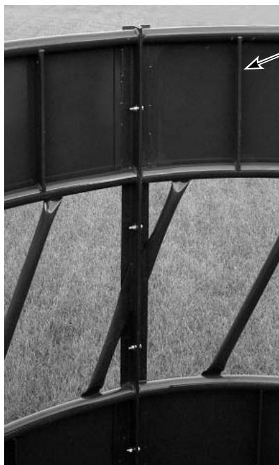
Top Supporting Strap with slot for the chain to the top